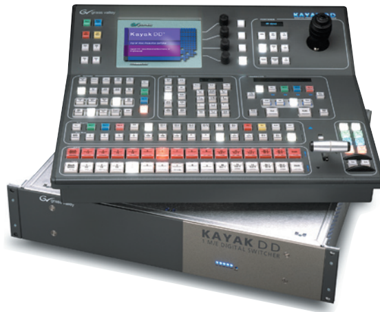
The KayakDD 1 M/E switcher is extremely portable. With a 19-inch control panel, its easy to set up in a rackmount drawer for flight case production systems.

20m DC power cable from KDD-PSU to mainframe or control panel