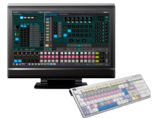
KRR-LIC-1ME-GUI provides a software and keyboard option for controlling Karrera.