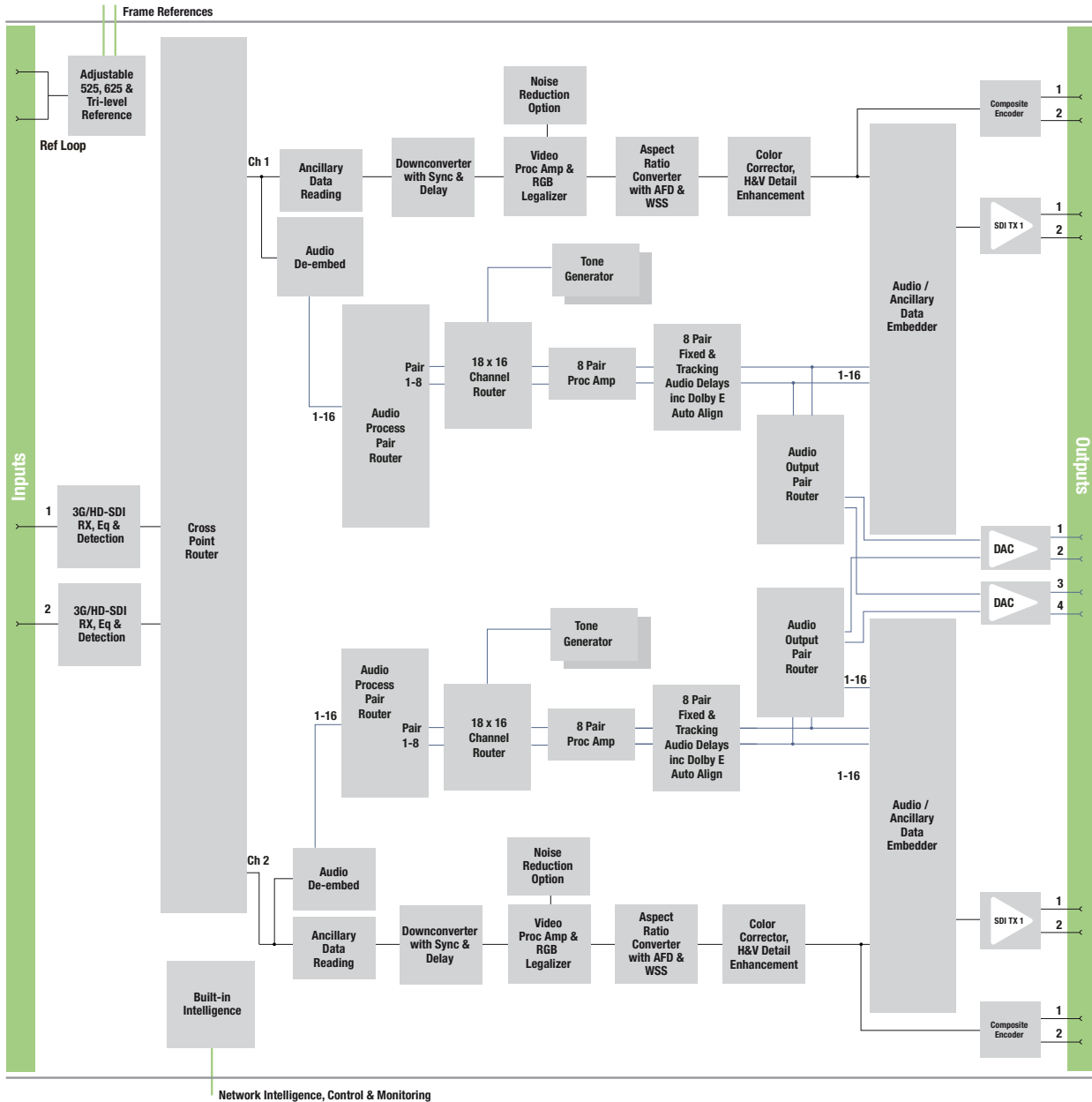
Block Diagram for IQDNC34 Range