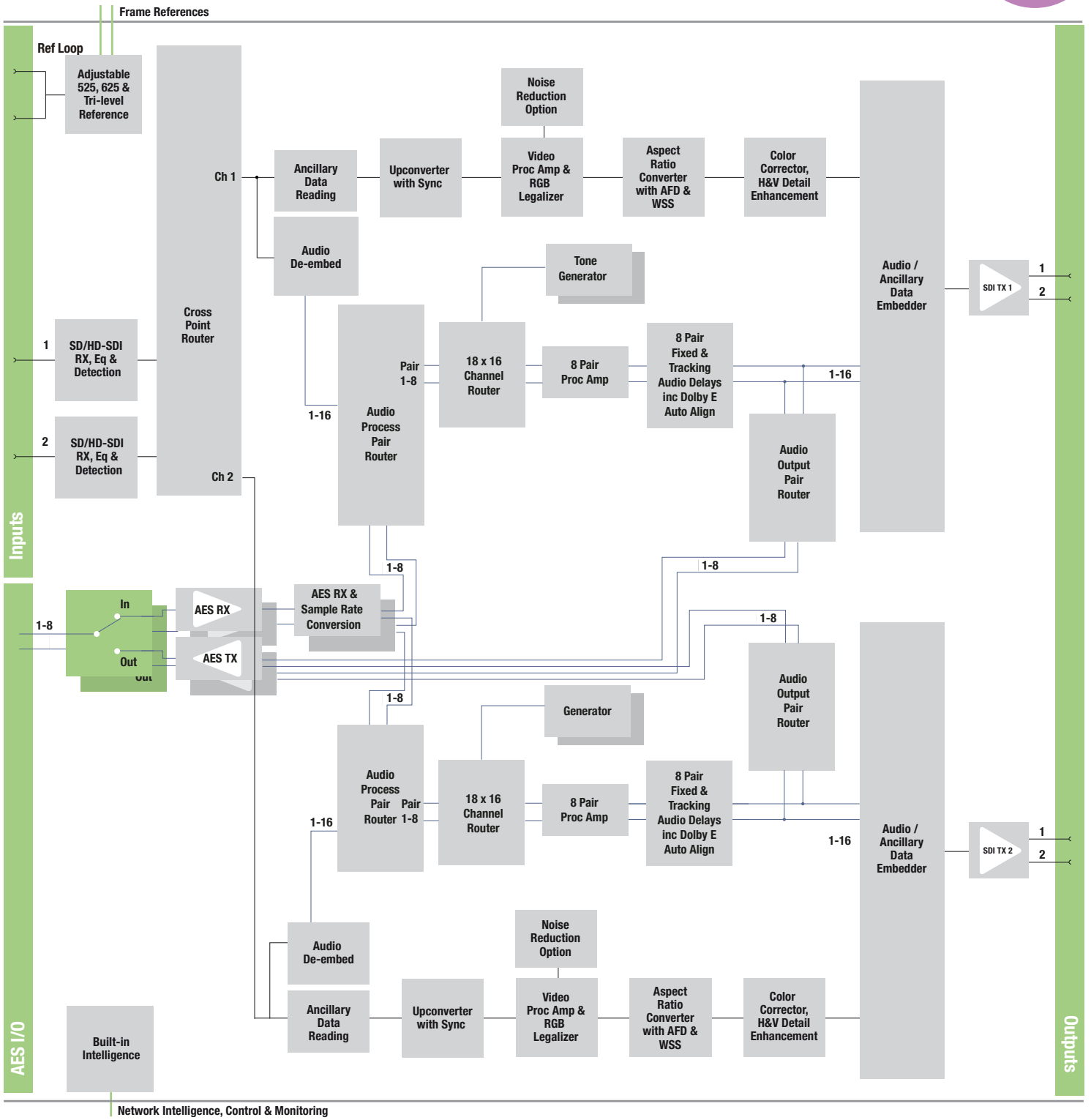
Block Diagram for IQUPC33 Range