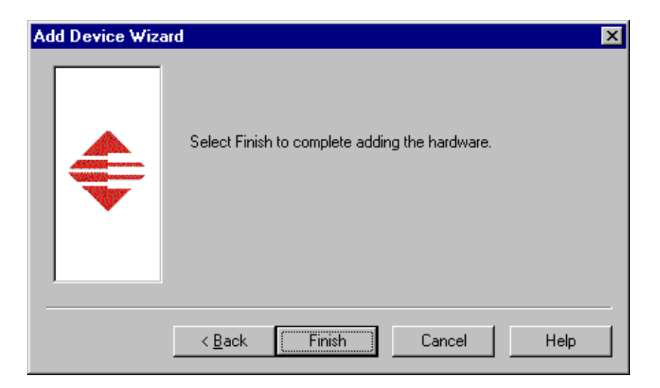
Figure 6. Finish the driver installation.

11. Click Finish to close the Add Devices Wizard (see Figure 6) and open the Device Properties dialog box.