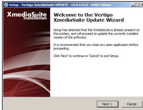
Figure 3-1. The Vertigo XmediaSuite Setup Wizard

The VERTIGO XMEDIASUITE SETUP WIZARD (figure 3-1) is an all-in-one installer that guides you through the process of installing or upgrading the Vertigo Suite software on a client workstation or hardware device.