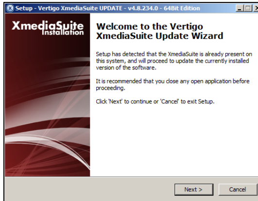
Figure 3-1. The Vertigo XmediaSuite Setup Wizard

The VERTIGO XMEDIASUITE SETUP WIZARD (figure 3-1) is an all-in-one installer that guides you through the process of installing or upgrading the Vertigo Suite software on a client workstation or hardware device.