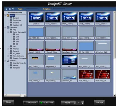
Figure 7-2. The VertigoXG Viewer

Operators can create a new page based on a template or open an existing page or scene for editing. The Vertigo graphics pages and scenes can then be added to the iTX channel's Schedule Grid or Timeline as secondary graphics events (XG type). See the Vertigo XG & iTX Integration User Manual for complete information and instructions.