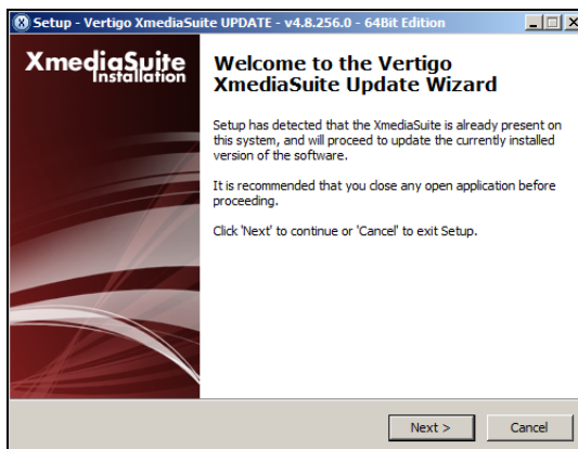
Figure 3-1. The Vertigo XmediaSuite Setup Wizard

The VERTIGO XMEDIASUITE SETUP WIZARD (figure 3-1) is an all-in-one installer that guides you through the process of installing or upgrading the Vertigo Suite software on a client workstation or hardware device.