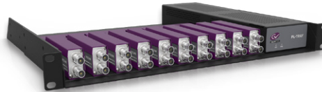
Rack mount frame option