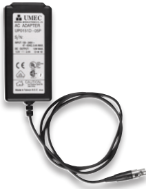
LKS-WSU Universal power supply