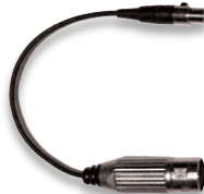
PicoPA 12V to 5V power adapter