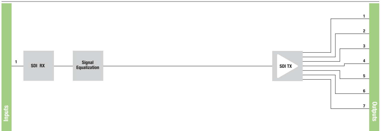
Block Diagram for IQSDA3347-1A3.